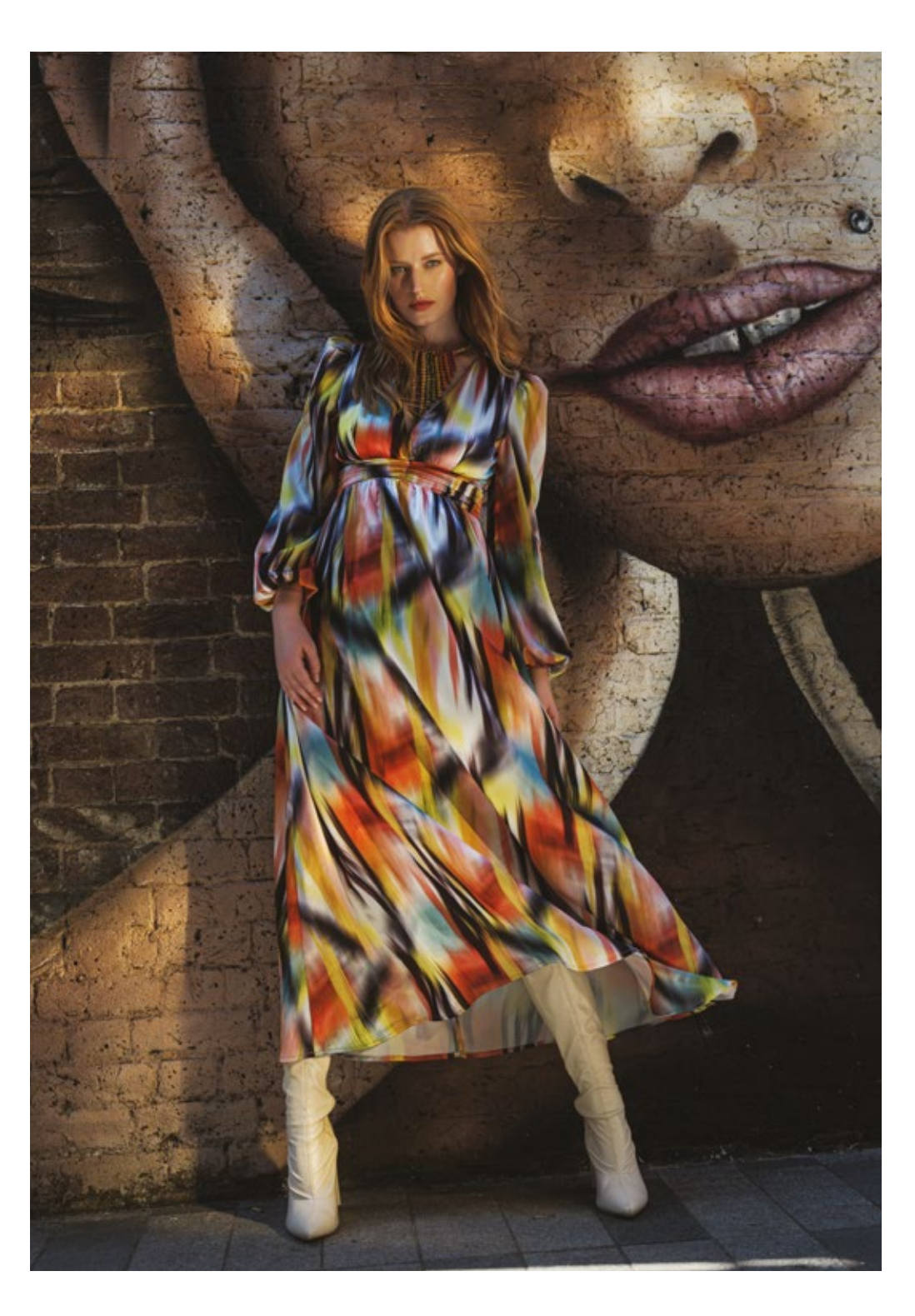
There are many fantasies that recall the animal and nature world, with a slight hint to the ethnic one.