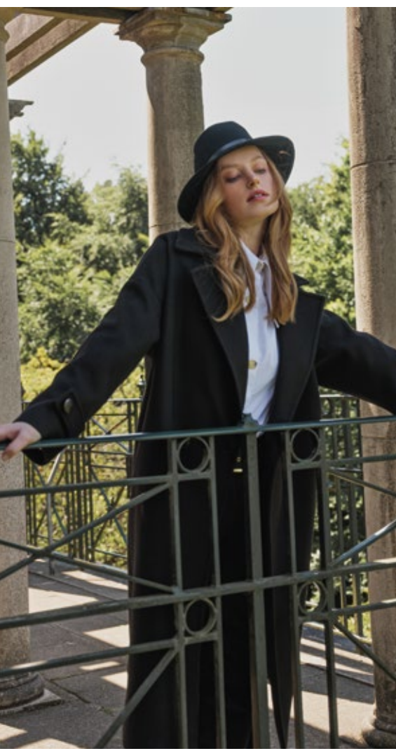
Overcoats with over fitting, coordinated in knit and structured outerwear. Our collection contains the best of the international catwalks, without forgetting the daily & confy spirit that has always distinguished our brand.